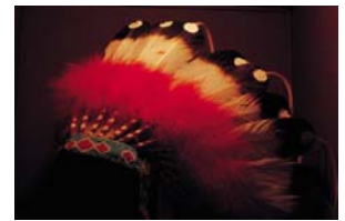
Exhibit Rules and Regulations

and inflammable fluid or substances are not permitted. Any exhibits or parts thereof found not to be fireproof may be ordered dismantled at the exhibitor's cost and risk.