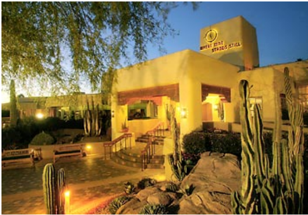
Main lobby entrance.

On-site Staff Office, Cholla Room Registration, Arizona Registration Desk Exhibits, Scottsdale and Paradise Ballrooms Opening Reception, Sonoran Terrace Ophthalmology Lectures, Flagstaff, Prescott and Sedona Rooms Otolaryngology Lectures, Tucson, Yuma, Nogales and Mesa Rooms