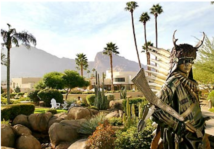
Camelback Inn's relaxing gardens.